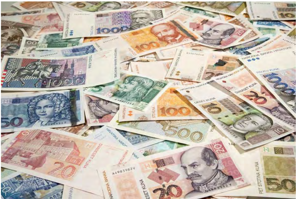
1. Croatian kuna banknotes, 2017