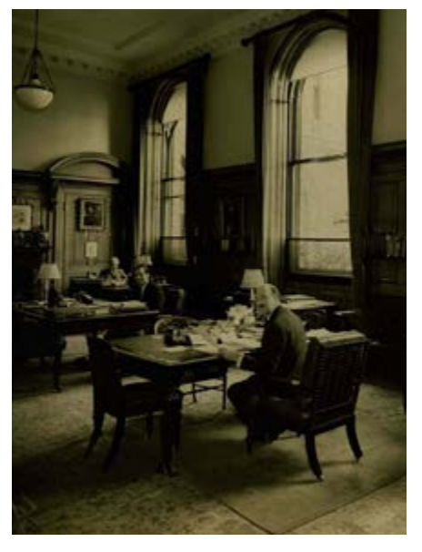
The Partners' Room in the second New Court (c.1960)

It is believed that there was a thoroughfare in Roman times running along the narrow line now called St Swithin's Lane, where traders made their way from the banks of the Thames to the City. The lane takes its name from St Swithin's church, which once stood at the south-western corner of the lane. 'St. Swithun' was a Saxon Bishop; according to legend if it rains on 15 July, St Swithin's Day, it will rain for the next 40 days in succession. The first mention of a house called 'New Court' was noted in 1720.3 By the early 1730s, the lane was described as 'a very handsome large place, with an open passage into it for a coach or cart. Here are very good buildings and at the upper end is a very good large house in-closed [sic] from the rest by a handsome pale'.4 In 1809, Nathan