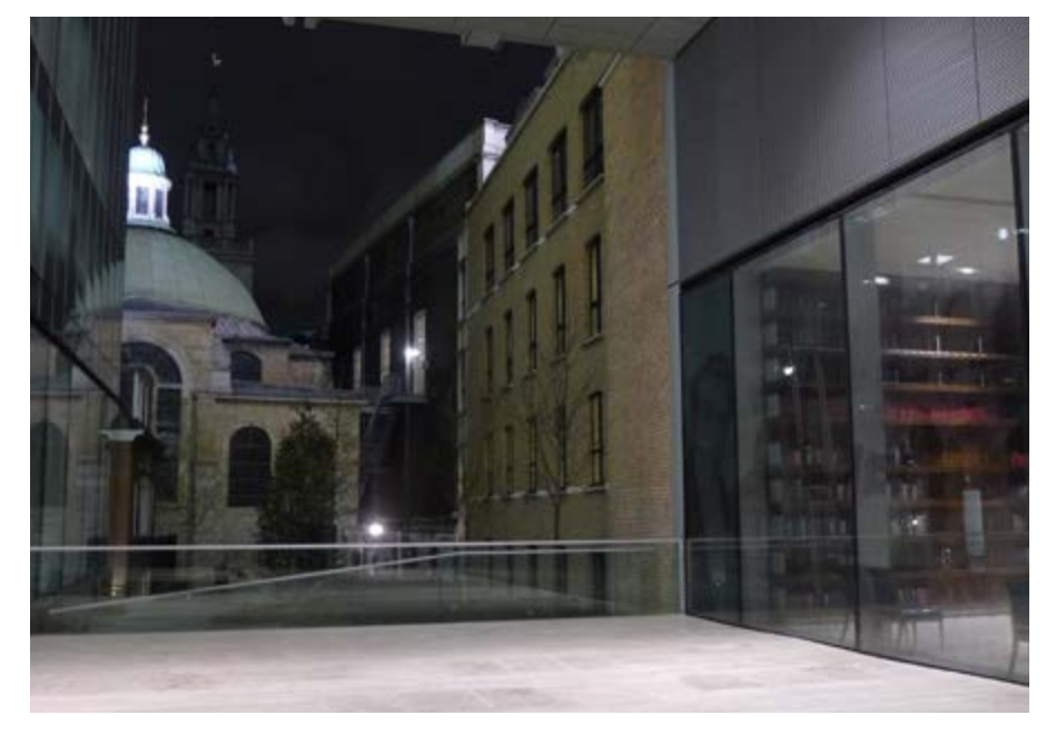
The fourth New Court, view of The Reading Room of The Rothschild Archive, and church of St Stephen, Walbrook