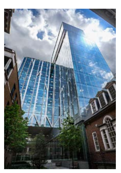
The fourth New Court

to a black glass and marble building very different to that which they had left. The main building had two floors below ground and six above, set back from the Lane, with two three-storey wings joining the main block at right angles, arranged, in a deliberate echo of the two earlier buildings, around a central courtyard. Externally defiantly of the 1960s, inside the building retained elements from its past. Granite setts from the old courtvard were laid in the new. Panelling, from 'the Old Room' used by Nathan Mayer Rothschild was incorporated in a new Partners' Conference Room. State-of-the-art fittings included air conditioning and a strongroom, with Europe's then biggest strongroom door, with a lock offering over 4,000,000,000 different combinations. The building was the visible symbol of a trend of modernisation within the firm, and in 1970 N M Rothschild & Sons became N M Rothschild & Sons Limited, with a board of directors.