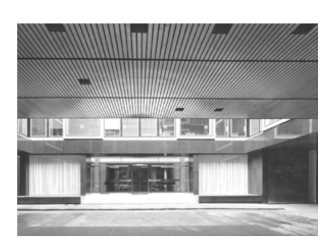
The Shield which hangs outside New Court to this day

The third New Court, main entrance, 1965