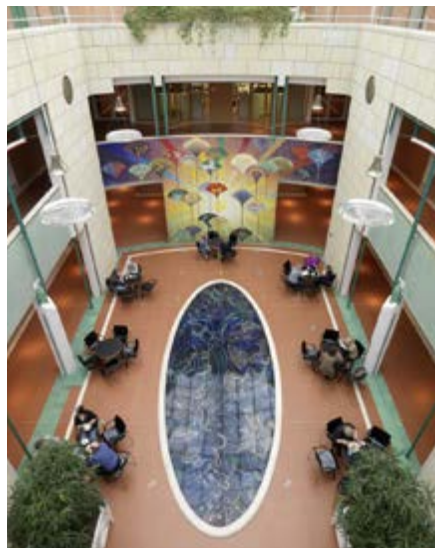
Horst Gläser, 'Wall and water basin', 1985-87, mosaic © VG Bild-Kunst, Bonn 2020

The hall to the left of the entrance rotunda contains cashiers' desks and is also open to the public. Here we see two pairs of