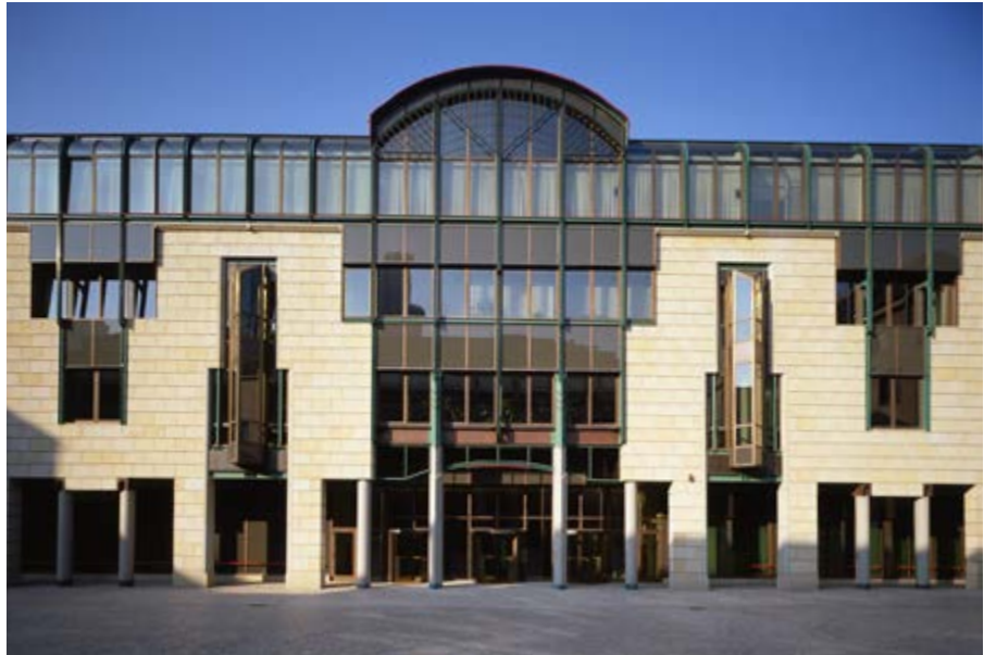
Regional office in Hesse, Taunusanlage, Frankfurt am Main, exterior façade of the new building