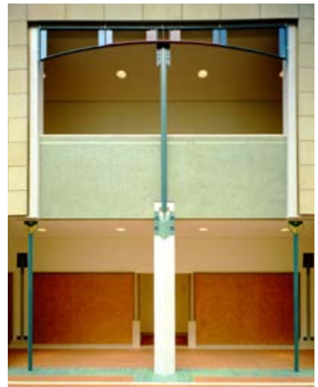
The central hall: a detail of the interior façade