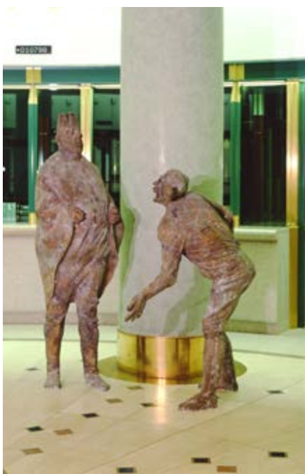
Statues in the hall containing the cashiers' desks: Karl-Henning Seemann, 'Mephistopheles persuades the Emperor', 1987, bronze © VG Bild-Kunst, Bonn 2020