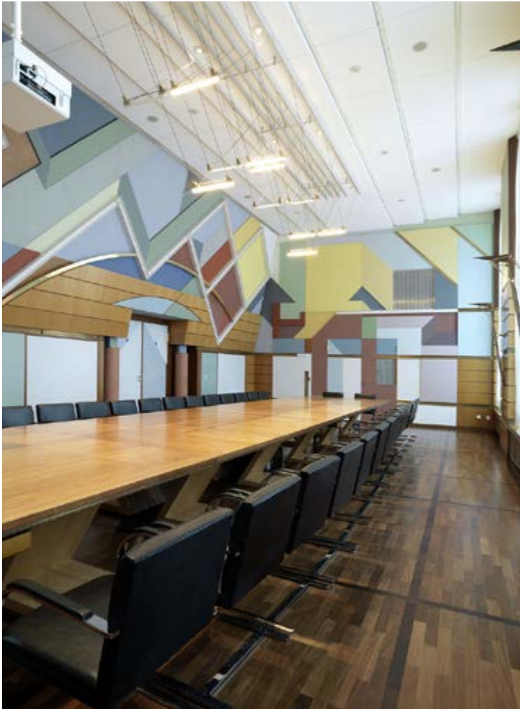
Notenbanksaal (conference room) with replica lamps and furniture