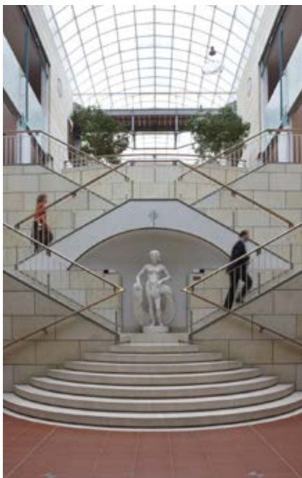
Staircase with statue: Willi Schmidt, 'Helen', 1987, marble