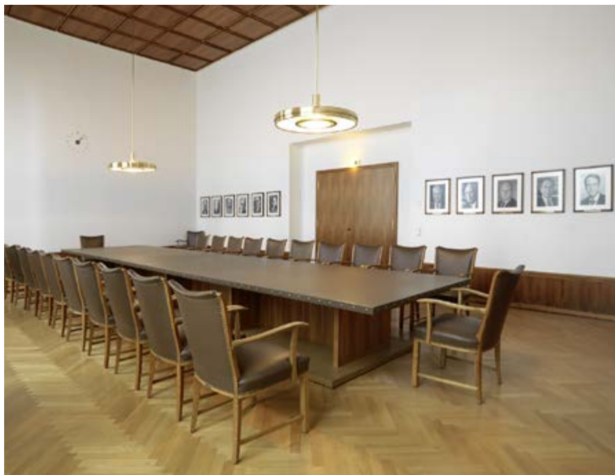
Historischer Saal (historical room)