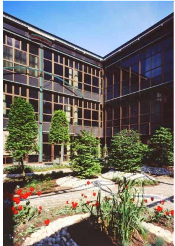
Looking into one of the six inner courtyards

front of this work shows, outlined in gold mosaic tiles, some ancient Greek and Roman gods and demi-gods, such as Neptune with his team of horses, Leda in the swan's embrace, and Nereid, who falls in love with Chiron.