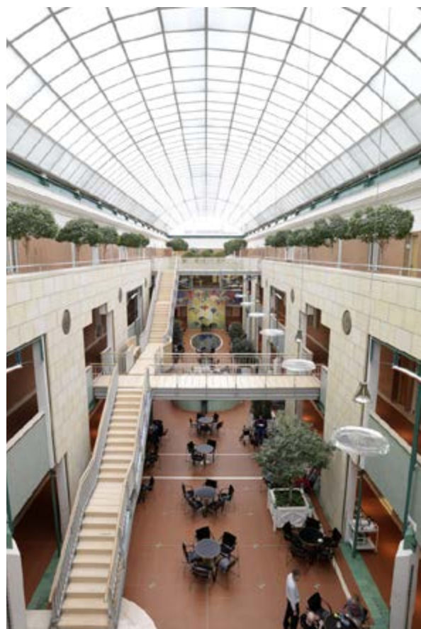
A view of the interior of the central hall with the arched roof

Inside, the heart of the building is the long, three-storey-high hall with an arched double layer glass roof. Visually, this hall is reminiscent of early shopping arcades and railway stations. Bathed in light and dotted with tables and chairs as well as indoor plants, it offers space to sit down and talk or relax. The Bank's staff and visitors can access the individual 'houses' behind the galleries on either side of the hall via a broad stairway and connecting bridges.