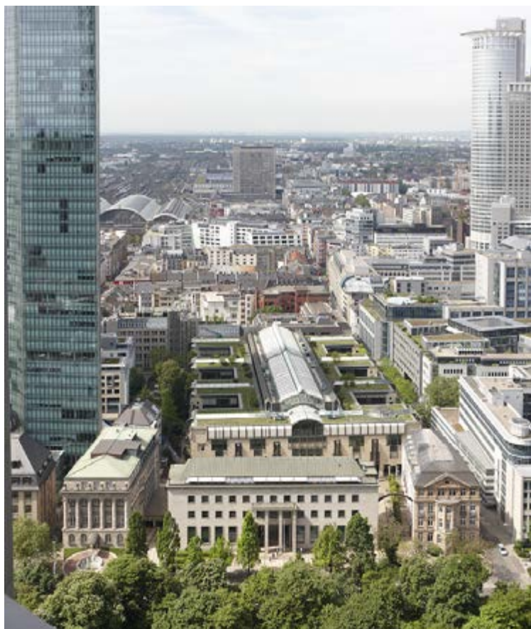
The four buildings of the regional office in Hesse: the old buildings in the foreground, with the former Reichsbank's Frankfurt head branch (middle) flanked by the two villas and with the new building behind it