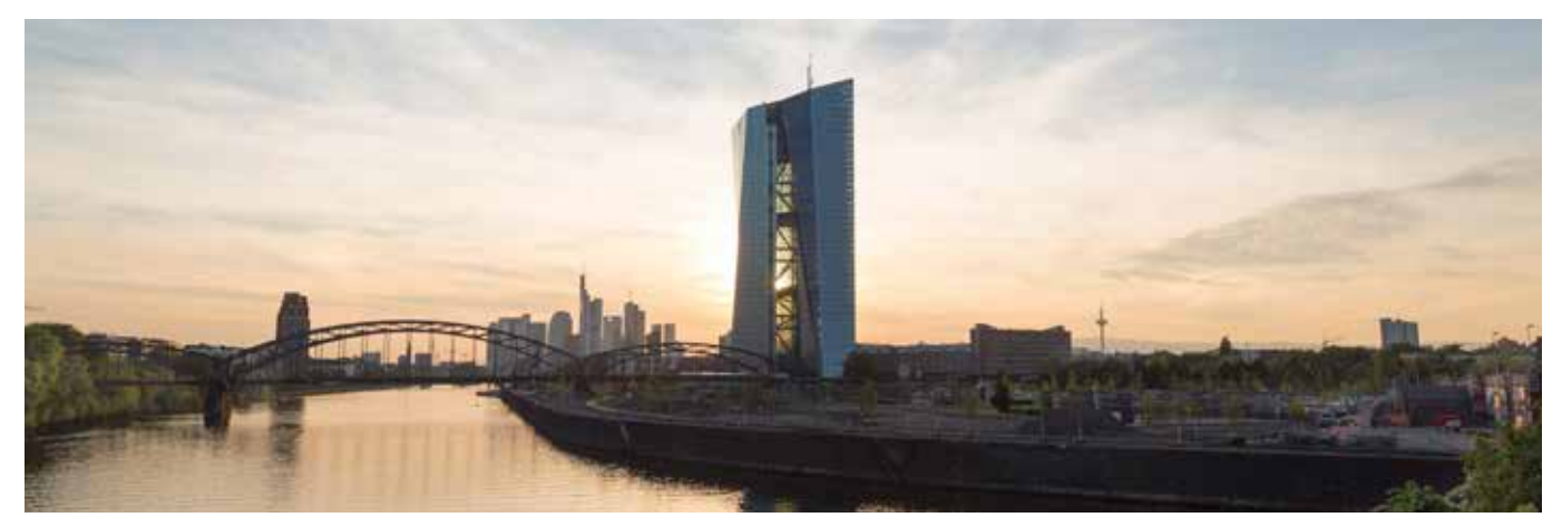
ECB-Premises, Ensemble © ECB / Robert Metsch.