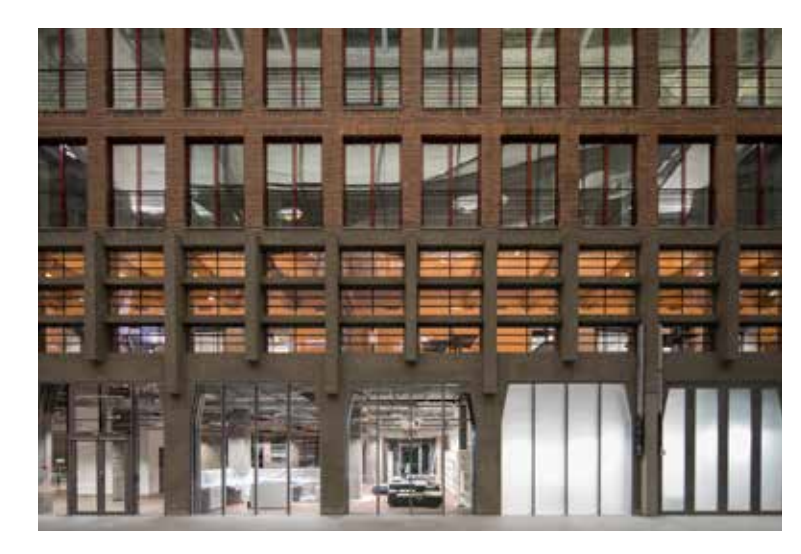
Grossmarkthalle