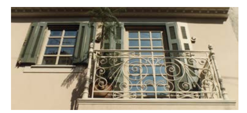
Detail of a residence in Plaka district