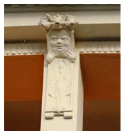
Detail of a residence