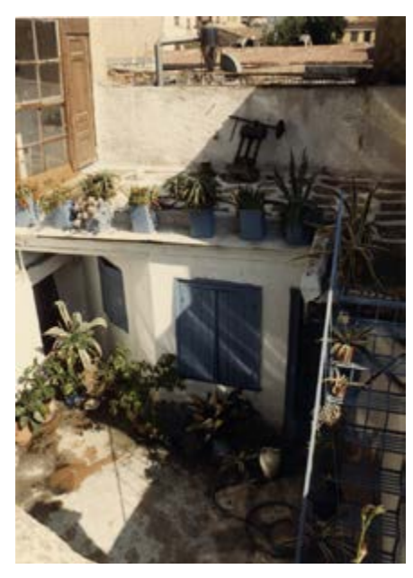
View of the inner yard of a neoclassical residence in Athens