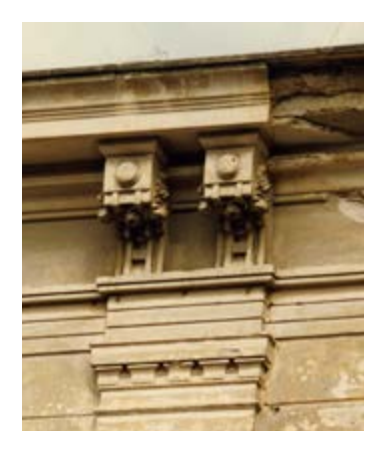
Details of a neoclassical residence