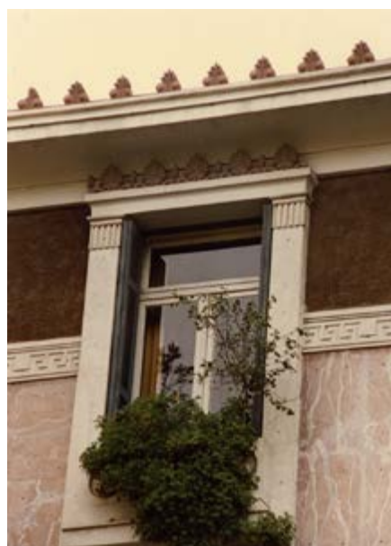
Detail of a residence