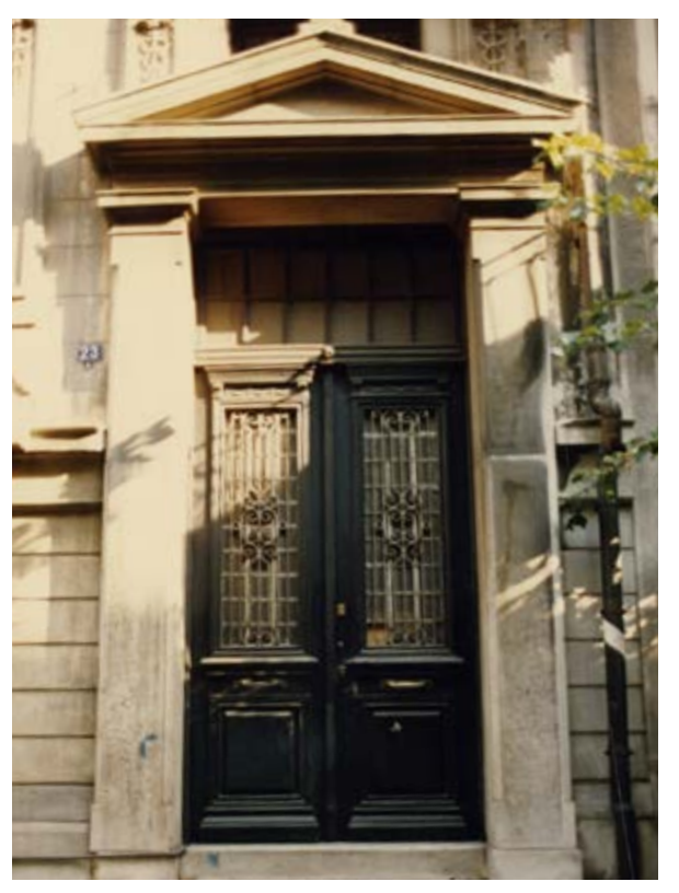
Entrance of a residence with clear neoclassical elements