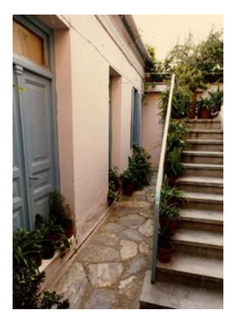
View of stairs and the inner yard of a neoclassical residence in Athens